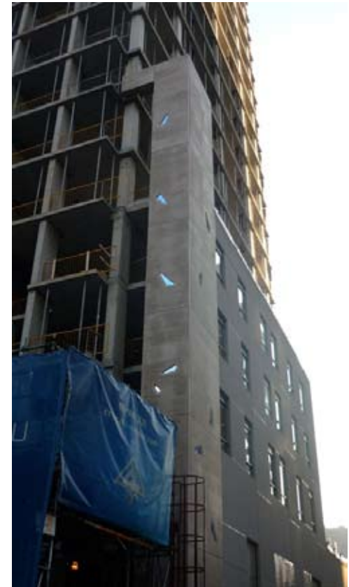
CRYSTAL BLU CONDOS, TORONTO → Castor's first major public art commission became the glass & concrete façade of a downtown condo development.