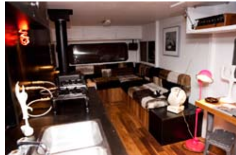
WINNEBAGO, IDS TORONTO, 2009 As invited designers for the 5x5 section of IDS, Castor gutted and redesigned a 23' Winnebago.