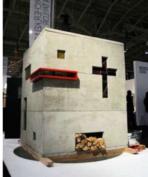
BETON BRUT, IDS TORONTO, 2008 As one of ten invited Canadian designers featured at the 2008 Interior Design Show, Castor installed a rough cast concrete ice-fishing hut with stained glass windows and a woodstove. The hut was made to showcase the prototype for the Invisible Chandelier.