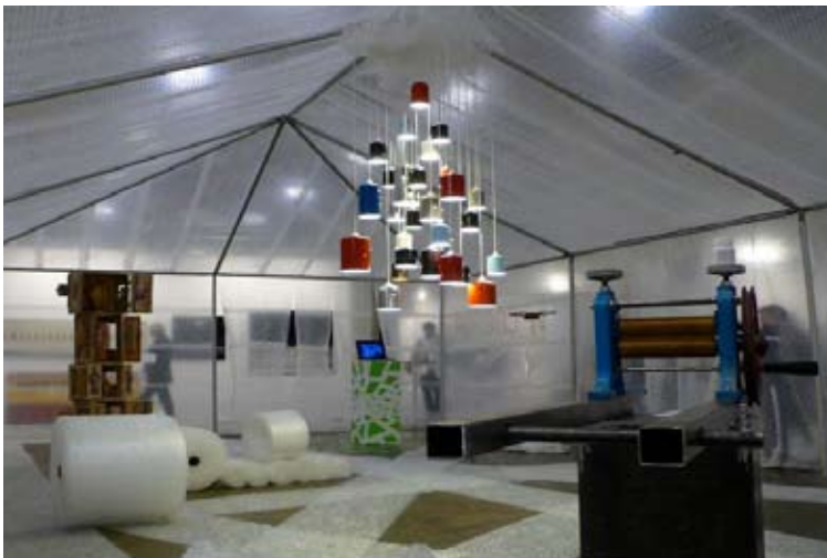
← NEXT LOUNGE, TIAF 2009 For the Toronto International Art Fair, Castor made a tent out of bubble wrap that functioned as a place to display art or just to enjoy making a lot of noise.